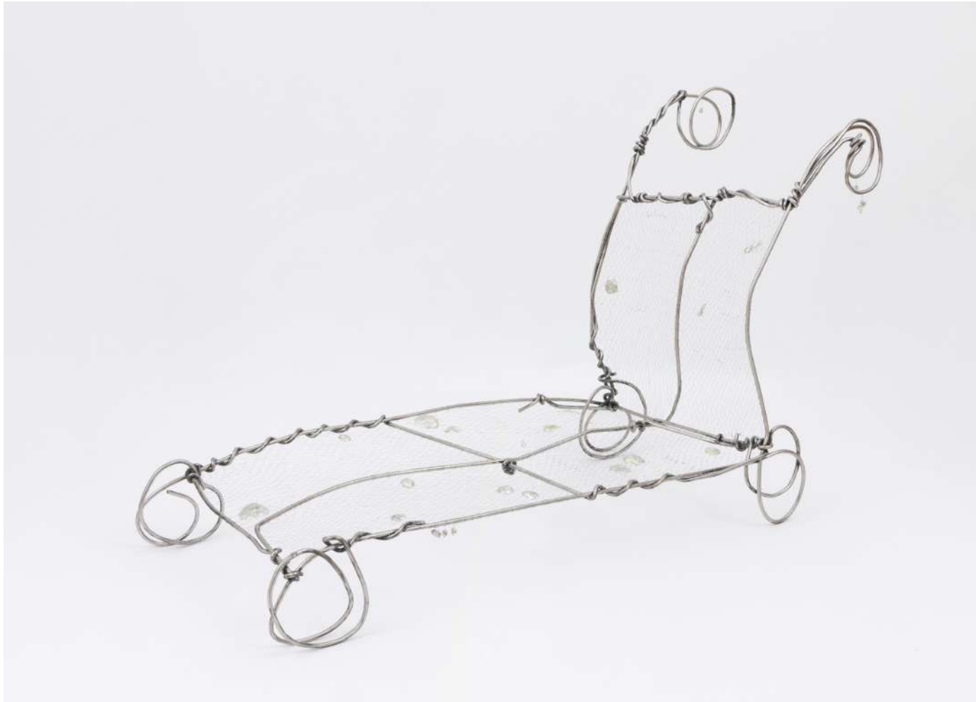
EMMA SAFIR folly chaise , 2025 Stainless steel, mirrored glass beads, pewter 39 x 70.75 x 26.5 inches 99 x 179 x 67 cm ESA038