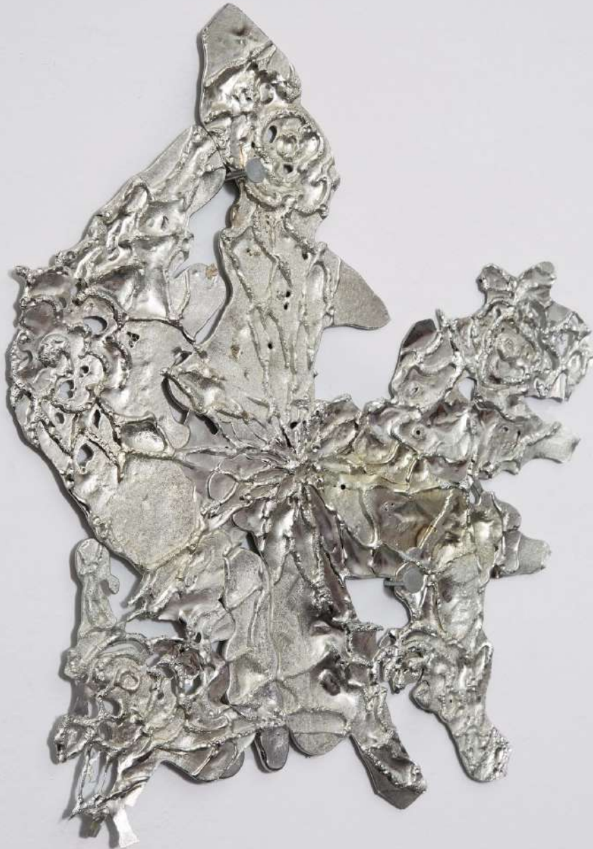
EMMA SAFIR Looking Glass , 2024 Pewter 11 x 11 x 1 inches 27 x 27 x 2 cm ESA019