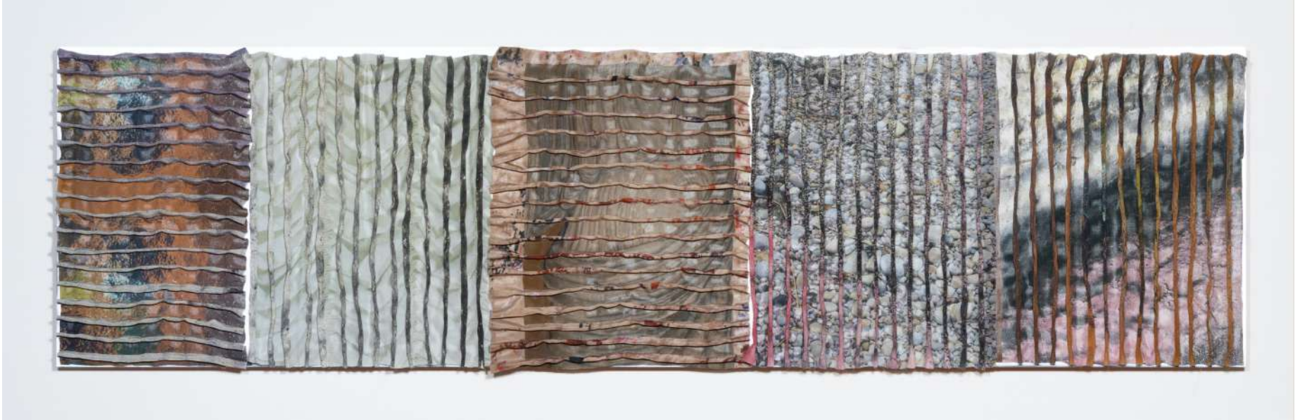
EMMA SAFIR MIRROR ETIQUETTE , 2025 (taken with flash)