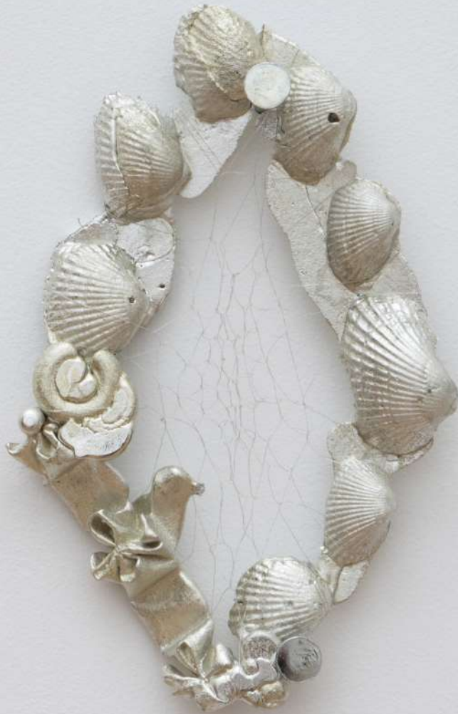
EMMA SAFIR Amalgamation (small) , 2025 Pewter, reflective thread 6 x 4 x 2 inches 15 x 10 x 5 cm ESA057