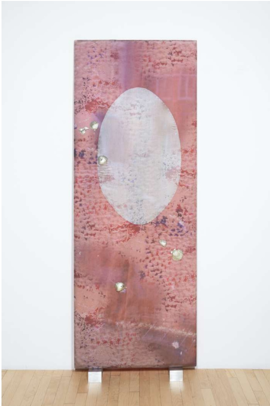
EMMA SAFIR Trumeau: Carnation , 2025 (taken with flash)