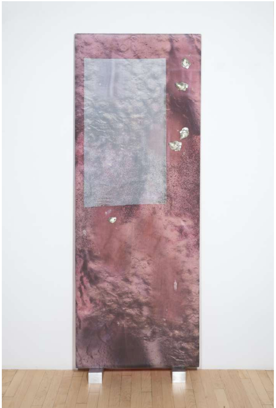
EMMA SAFIR Trumeau: Mauve , 2025 (taken with flash)