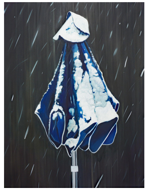
Closed for Winter, oil on canvas, 2021, 51 x 39 in

Sonder: n. the realization that each random passerby is living a life as vivid and complex as your own-populated with their own ambitions, friends, routines. worries and inherited craziness—an epic story that continues invisibly around you like an anthill sprawling deep underground, with elaborate passageways to thousands of other lives that you'll never know existed, in which you might appear only once, as an extra sipping coffee in the background, as a blur of traffic passing on the highway, as a lighted window at dusk. - John Koenig, The Dictionary of Obscure Sorrows