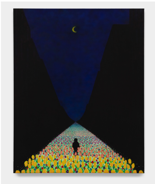
Nocturne: My love, hope, and sweet dreams. I'm still here and that is all that matters acrylic, flashe, and gouache on canvas, 60 x 48 in, 2021