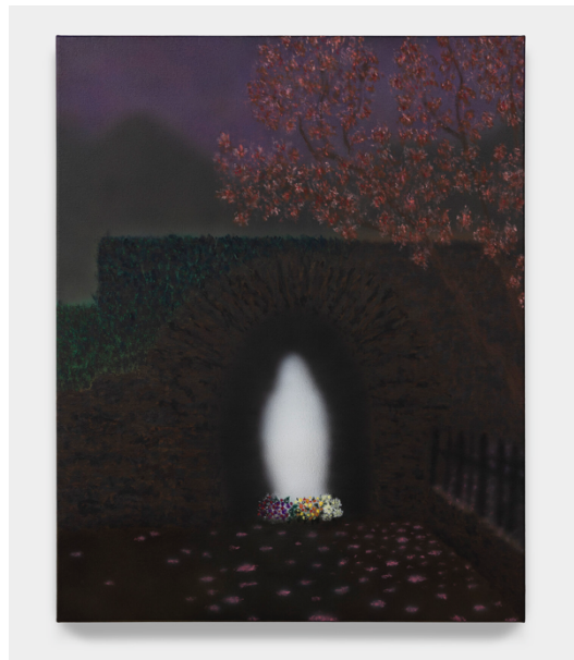
Nocturne: One day I'll become a star in the night sky and protect you forever acrylic, flashe, and gouache on canvas, 30 x 24 in, 2021