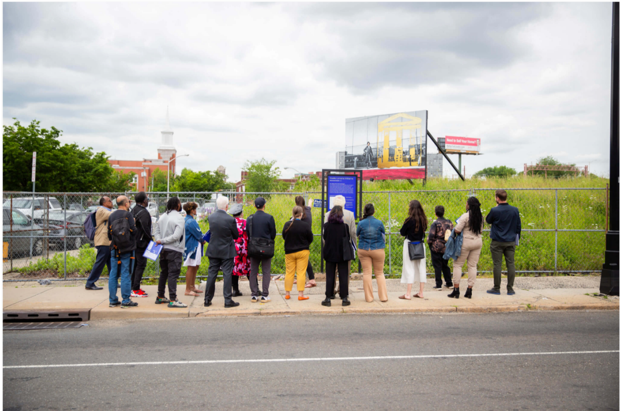
Presentation attendees stand in front of Monumental Newark: Reimagined Sites of 19th Century Newark site intervention by Noelle Lorraine Williams.

Monumental Newark: Reimagined Sites of 19th Century Newark site intervention by Noelle Lorraine Williams