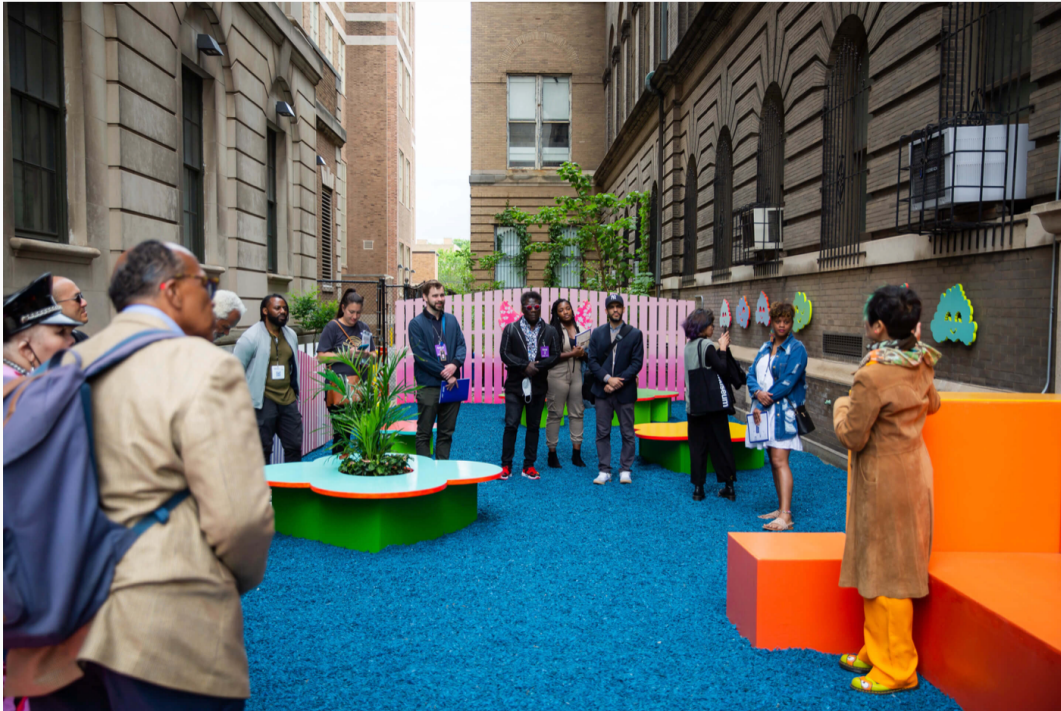
Presentation attendees stop by Spectrum of Joy , a children's reading space by Cazorla + Saleme.

Spectrum of Joy children's reading space by Cazorla + Saleme