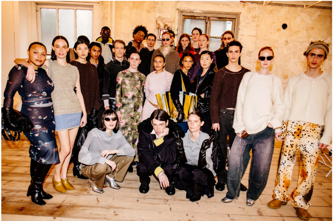
The model crew at Eckhaus Latta's fall 2025 show