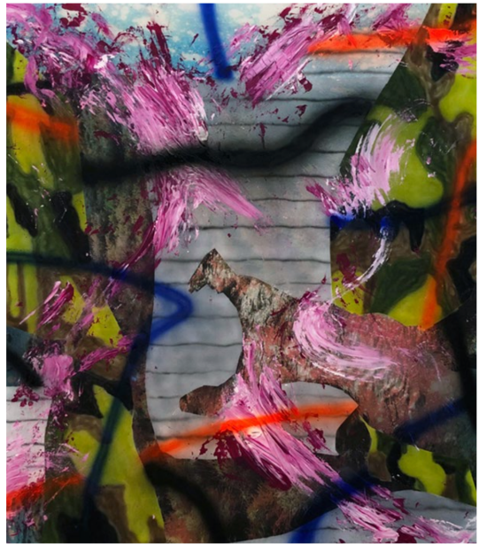
Sung Hwa Kim A.S. #3, 2018 Inkjet, Dyed fabric, Acrylic on Cotton 31 x 27 in.